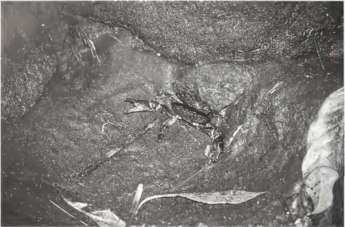
Figure 2. A potential additional predator of young swifts, a crab in the family Pseudothelphusidae, which was observed on 4 June 1996 carrying a moribund nestling from a nest placed near water level

On hatching (day zero) nestlings had a mean mass of 8.75 g ( n = 6 ; range 7.7–9.4 g, or 8.3% of adult size; for adult size see Table 2). Body mass increased fast, healthy nestlings reached adult mass by days 21–22 (Fig. 1A). On average, max. body mass reached by nestlings was 110.9 g (105.9% adult size) by 33 days. The max. body mass reached by any nestling was 133.7 g, or 127.6% of adult mass, at age 33 days. The growth constant was k = 0.225 and T_{(10-90)} period was 19.5 days. During the T_{(10-90)} period the fastest-growing birds increased mass at a rate of 4.1 g per day, or 3.19% of adult mass per day. Within the Cypseloidine, the growth trend is that the largest species are fastest and the smallest are slowest, in direct contrast to most avian groups (Gill 1990, Marín & Stiles 1992, Marín 1997, 1999).